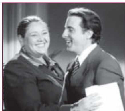
Camryn Manheim congratulating Andy Garcia