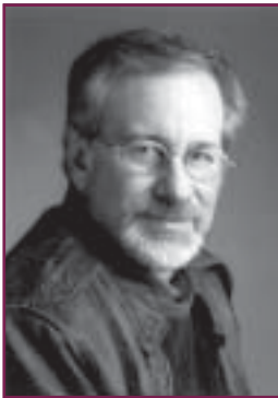
Steven Spielberg, Executive Producer of Award Winning show, Pinky and the Brain

"Many people in Hollywood are doing a spectacular job educating Americans, both young and old, about the true nature of drug abuse and addiction and its consequences for all aspects of their lives."