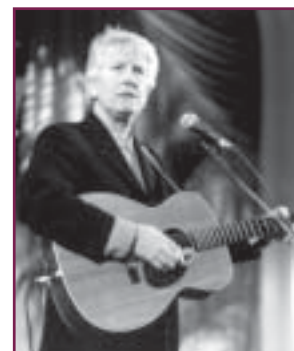
Graham Nash performing Teach Your Children Well