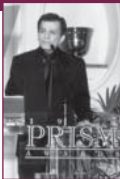
Left: Casey Kasem, Official Host of the 1997, 1998, and 1999 PRISM Award Ceremony.