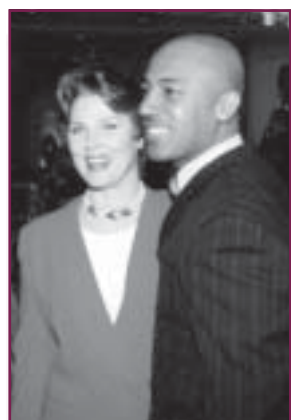
Mariette Hartley and Montel Williams