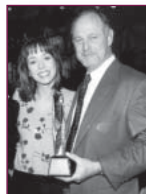
Mackenzie Phillips and Gerald McRaney

Beach Boys: Family and Friends and Graham Nash