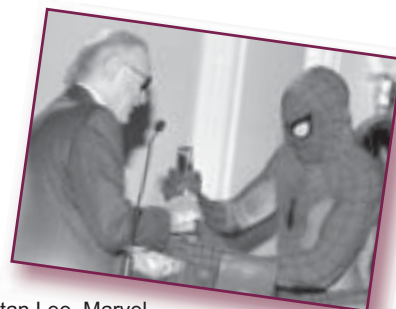
Stan Lee, Marvel Comics, sharing award with his creation, Spiderman

Leeza - "Special Report: Kids, Booze, and Binges"