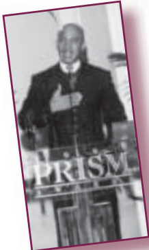
Award Winner Montel Williams

Special PRISM Awards are presented for leadership and inspiration by example. These spotlight an individual who has, through his or her public image, creative choices, public activities, and personal example, served as a positive role model to the entertainment industry.