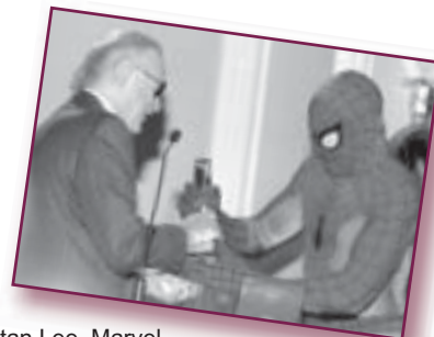
Stan Lee, Marvel Comics, sharing award with his creation, Spiderman